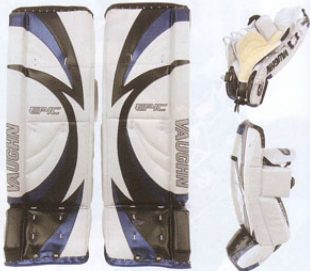
These standard colors available