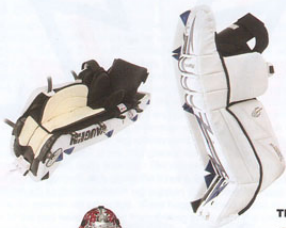
These standard colors available