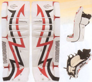
These standard colors available