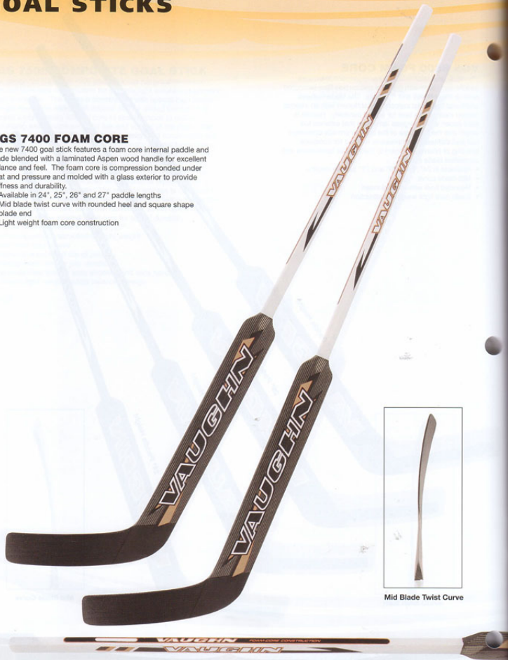
Mid Blade Twist Curve